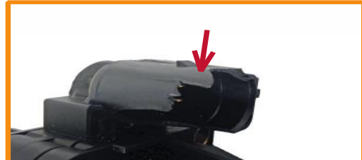
Cracked or damaged plastic parts