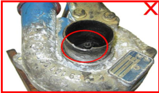
Broken flanges / interfaces